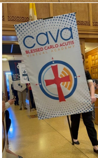
All Schools Mass – Jan. 29, 2025