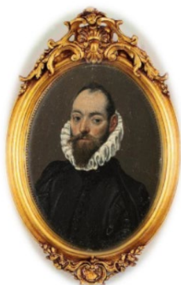
El Greco (Doménikos Theotokopoulos) (Born 1541 in Heraklion, Greece; Died 1614 in Toledo, Spain). Miniature of a Man , 1586-1590, Oil on cardboard, 7.9 x 5.7 cm, The Hispanic Society of America, New York, NY

https://bocamuseum.org/art-education/school-tours