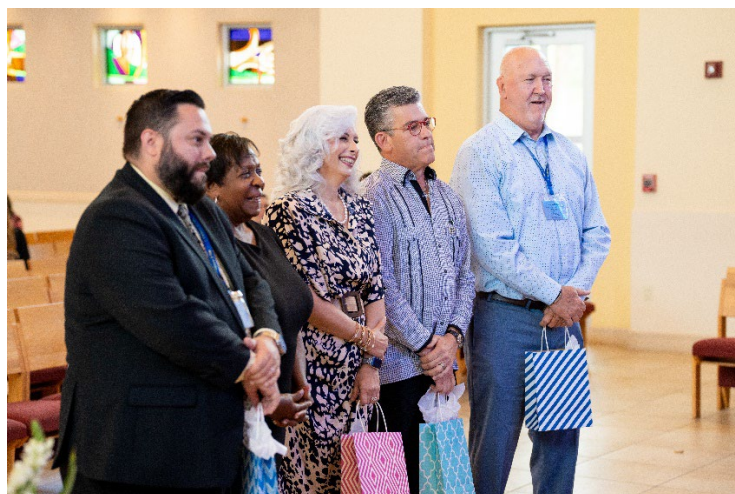
Congratulations to our departing principals! Thank you for your service!

August 2: Principal Meeting at Immaculata LaSalle High School. All pastors are encouraged to attend in the afternoon.